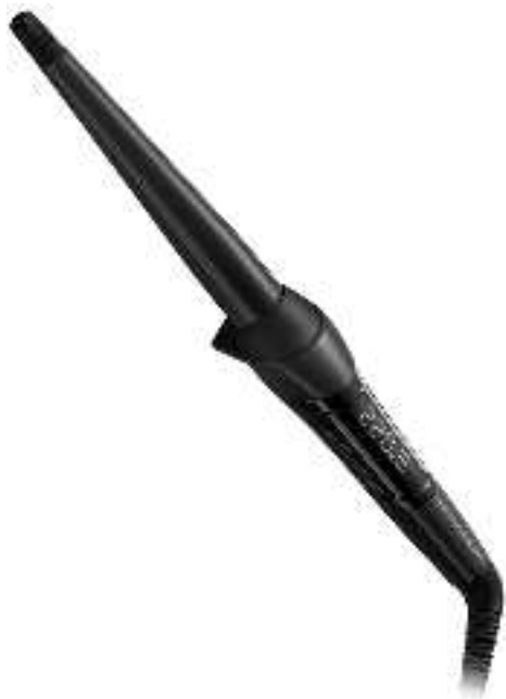
Professional Silk Curling Wand CI96W1