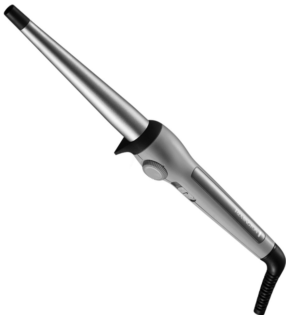
Coconut Smooth Curling Wand CI5901